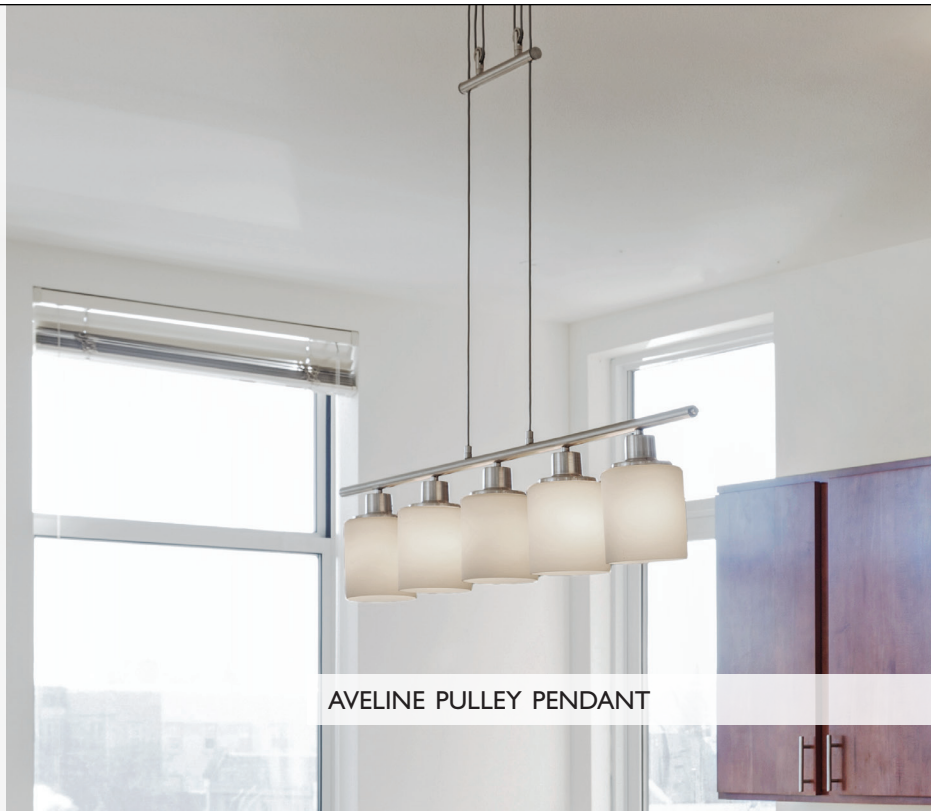
AVELINE PULLEY PENDANT

Get light where you need it with the Aveline Pendant. This pendant features a working pulley mechanism that allows the light to be adjusted between 4' and 11' from the ceiling. Perfect for rooms with tall ceilings where it can be tricky to get the light at just the right height over the counter, island or table. The contemporary styling, satin nickel finish, and sleek frosted glass shades blend seamlessly with a variety of home décor styles.